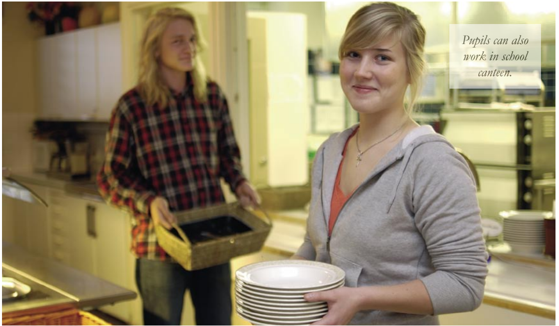
Pupils can also work in school canteen.